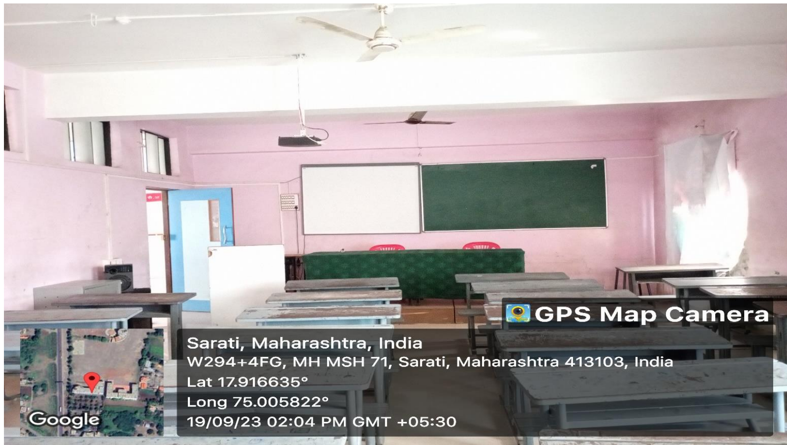
Seminar Hall with ICT Facilities