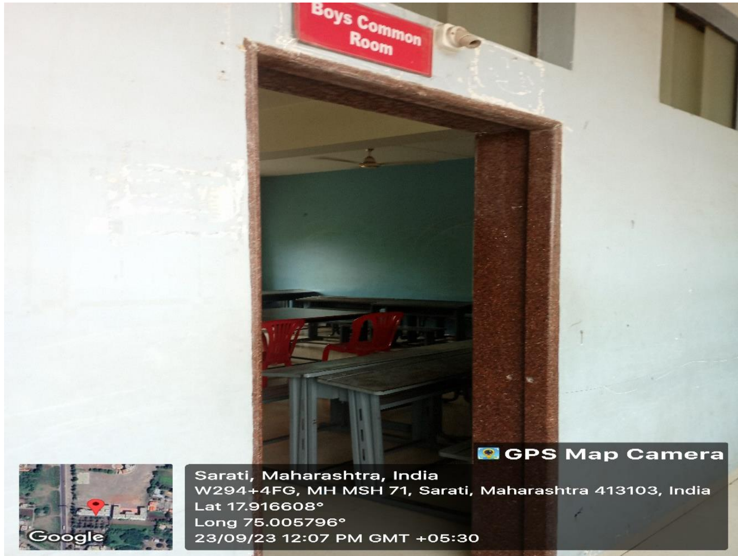
Boys Common Room