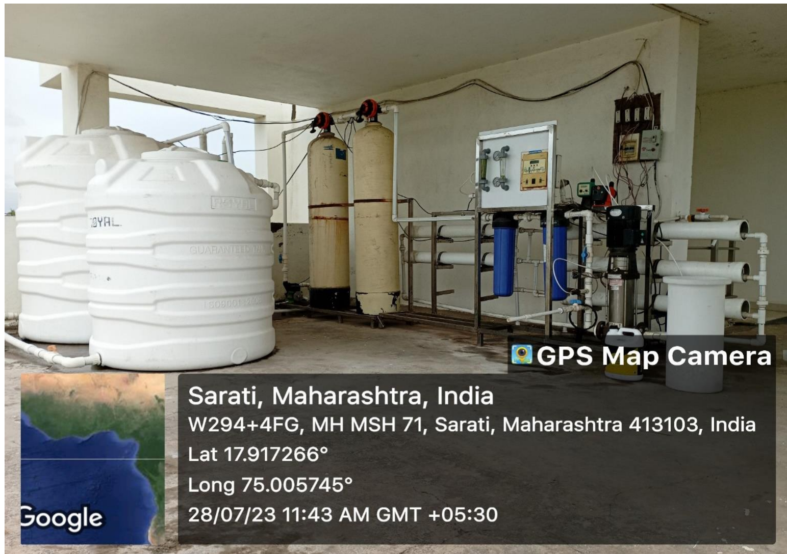
RO Water purifier plant