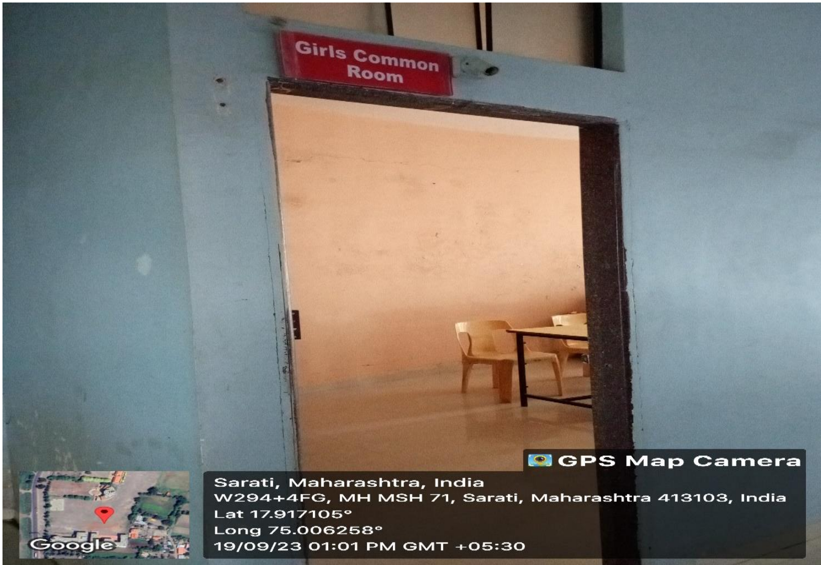
Girls Common Room