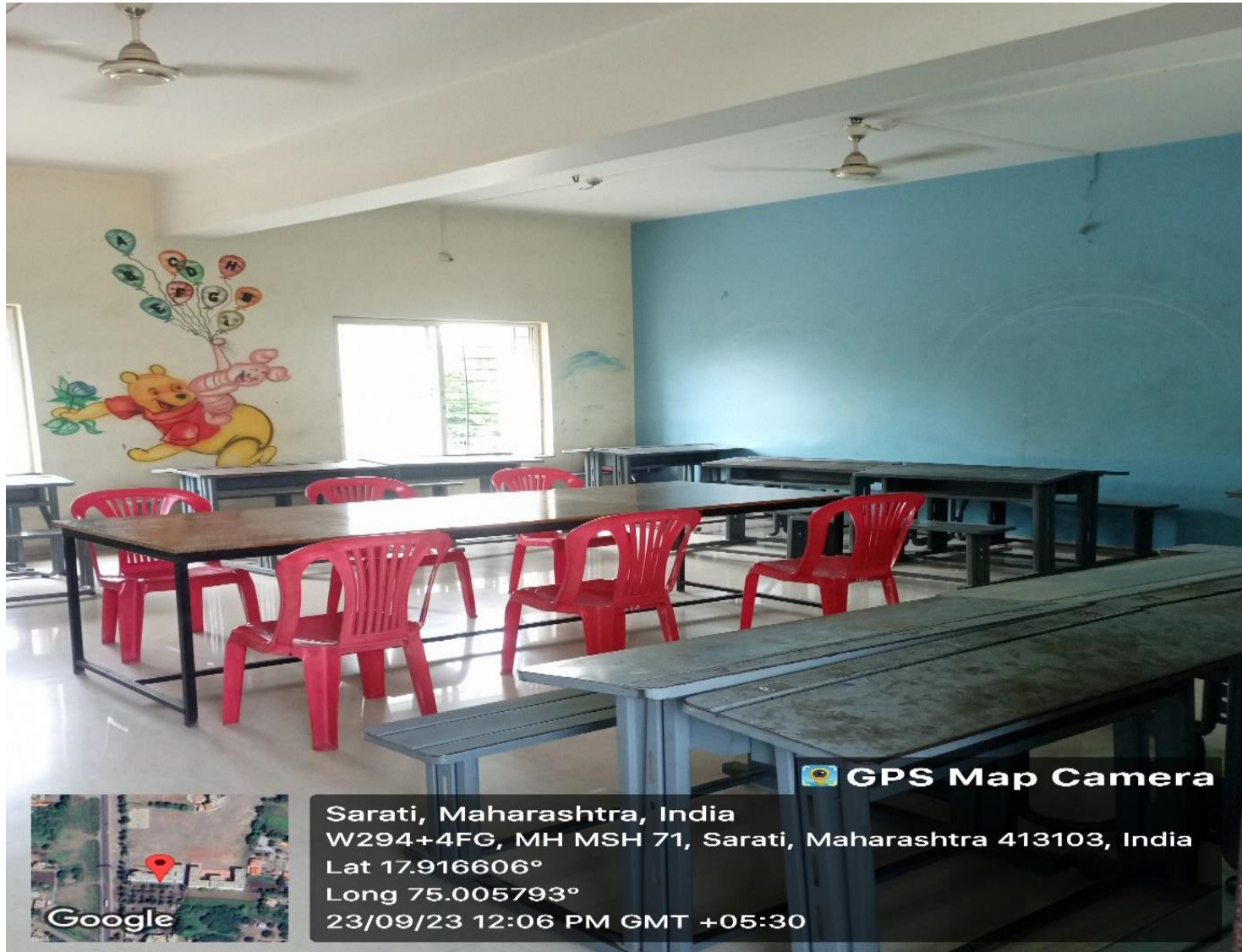
Boys Common Room