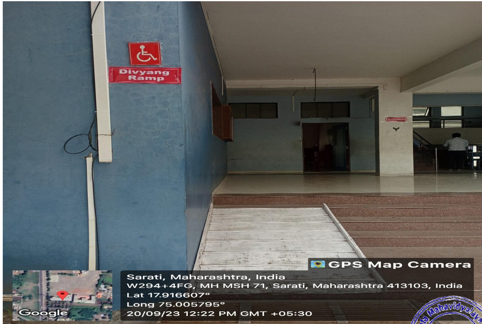
Ramp for Divyang