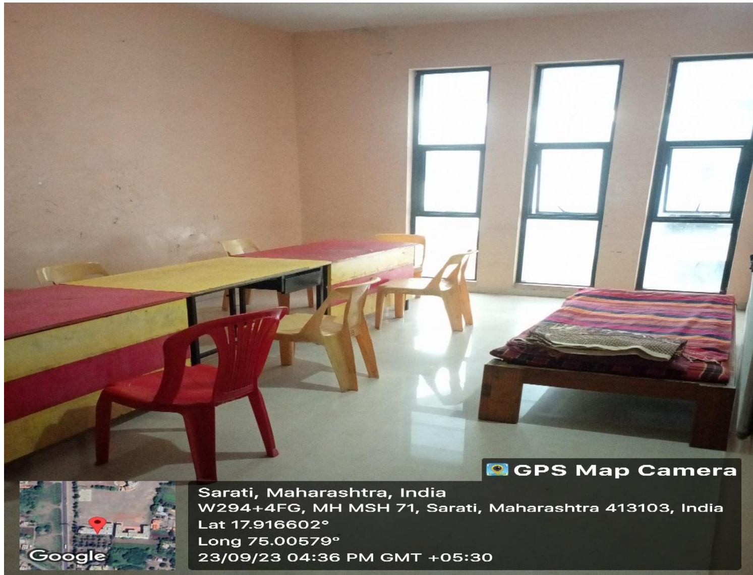
Girls Common Room